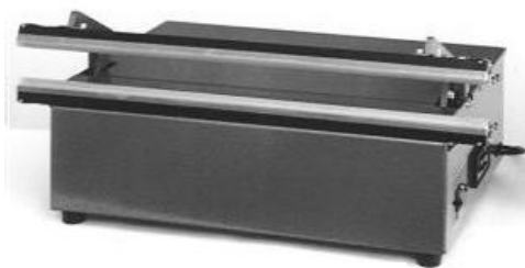
Bench top mounting